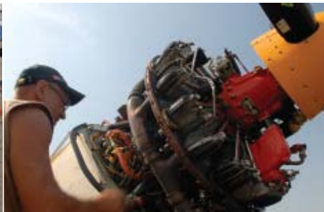
You need every one of those 360 horses to win