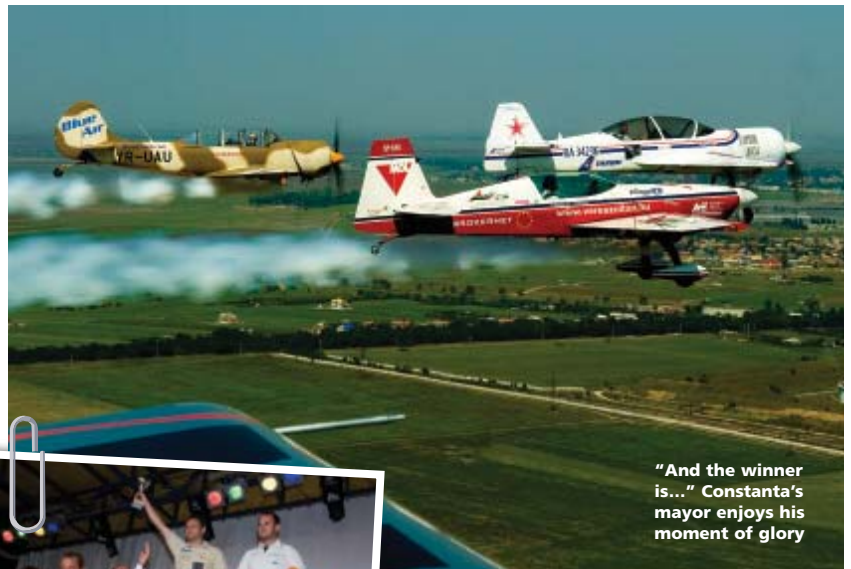
"And the winner is..." Constanta's mayor enjoys his moment of glory

Next up are Andy and Peter and it's interesting to compare the high speed Extra and the extremely manoeuvrable Sukhoi in close combat. The Su-29 will outturn the EA-300, but the Extra can pull away and out of range in the straight and level. In the end the victory comes down to tactics and Peter pulls up into a victory roll to the delight of the crowds.