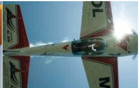
Watch the birdie! Zoltan enjoys some hot-dogging